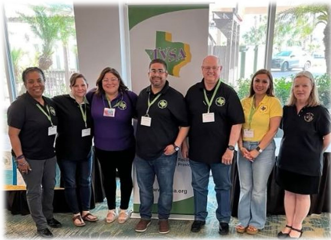
Members of the TVSA Board of Directors and Staff at the 25th Anniversary Celebration Conference